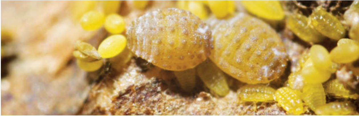
Phylloxera adults, nymphs and eggs.