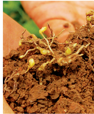
Galls on grapevine roots.

the roots leave them prone to developing root rot. Depending on the phylloxera strain, leaf galls may occur on the leaves of suckers of American Vitis rootstocks. Grapevines grafted to phylloxera tolerant rootstocks or nursery plantings may show signs of phylloxera insects on the roots and damage in the form of nodosities, however visual symptoms in the canopy do not occur, which makes detection difficult. Grafted vines can sustain populations of phylloxera, which can spread to ungrafted vines.