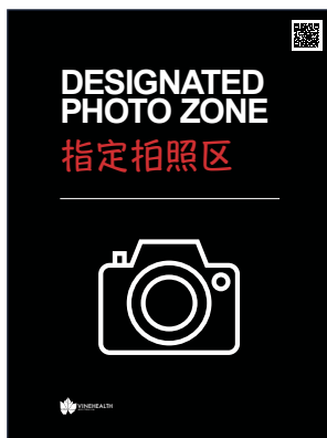
PHOTO ZONE SIGN