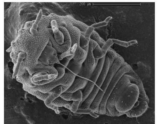
Phylloxera under the microscope

So this weekend during Sea & Vines Festival, and frankly, any time you're winery hopping, whether or not you believe there's a little bug backpacking with you, don't walk through the vines.